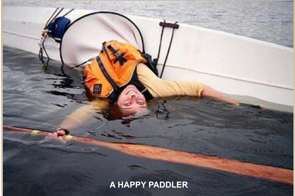
A HAPPY PADDLER