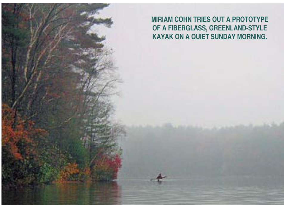
MIRIAM COHN TRIES OUT A PROTOTYPE OF A FIBERGLASS, GREENLAND-STYLE KAYAK ON A QUIET SUNDAY MORNING.

There's some wildlife at the Pond. The odd woodchuck can be seen lurking in the rocks. Surprisingly large turtles climb out of the water once a year to lay and bury their eggs next to heavily-walked paths. There's the occasional sighting of the old master turtle named The General who is huge. We steer clear. The pond gets stocked with fish. I'll have to ask